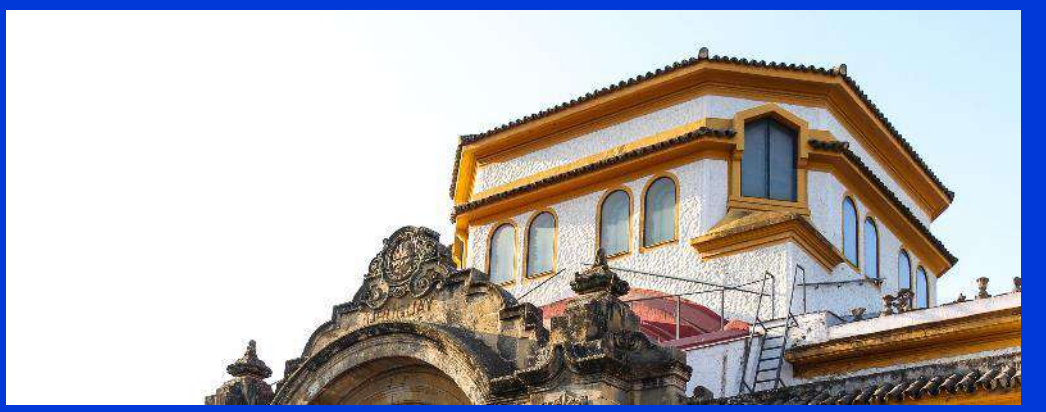
Back to index

Avda. de Chile, s/n Tel: +34 954 486 010 http://www.sacu.us.es