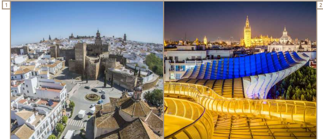
1. Panoramic view of Carmona 2. Metropol Parasol, Seville