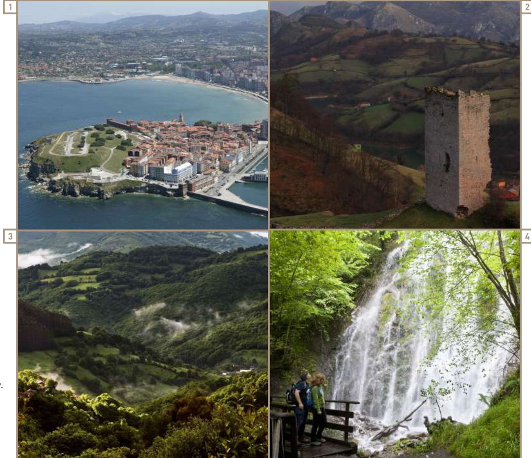
1. Aerial view of Cimavilla, Gijón 2. Peñerudes medieval tower, Morcín 3. Cuna and Cenera Valley, Mieres. 4. Xurbeo Waterfall, Aller