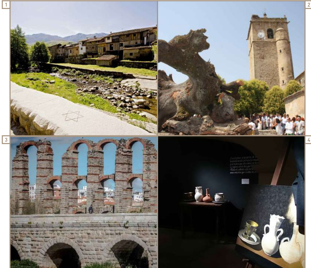
1. Jewish Quarter, Hervás. 2. El Tuero. Tradition and culture. 3. Roman bridge and aqueduct, Mérida 4. House Museum of the painter Francisco de Zurbarán. Fuente de Cantos